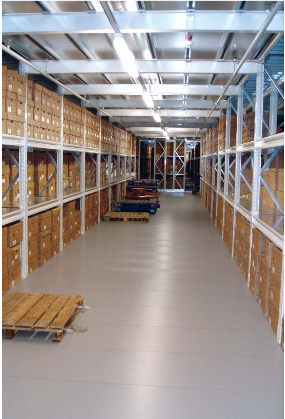
Iron Mountain ® in Belvedere, UK with ResinDek Xspan installed for rigorous loads of 1,000 kilograms 100 times a day