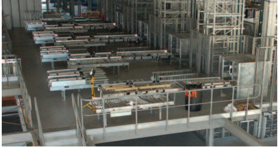
130,000 square feet of ResinDek LD50 installed at a Warehouse Distribution Center in Canada.

Extensive testing and simulation of actual field conditions are part of why Cornerstone Specialty Wood Products continues to introduce and maintain a reliable family of mezzanine flooring products.