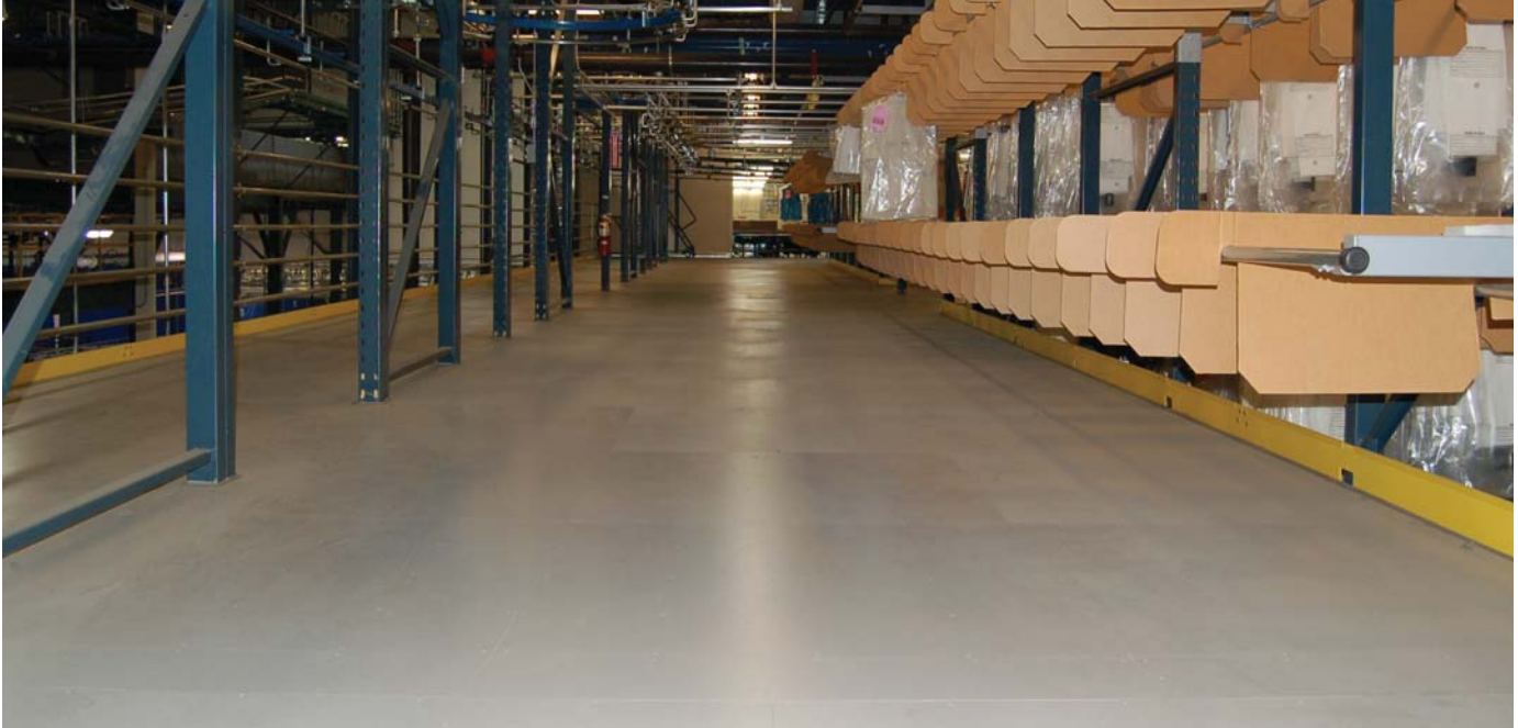
Polo Ralph Lauren facility with ResinDek products installed

Within 3 years of installing 140,000 square feet of poly-deck flooring panels in 1985, the Polo Ralph Lauren Corporation started having problems with their poly-deck flooring panels in their highest traffic areas with cart weights of only 800 lbs.