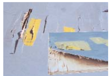
Extensive substrate failures and "alligator skin cracks" were evident throughout this job site before the poly-deck was replaced.

Leave it to the experts to select ResinDek