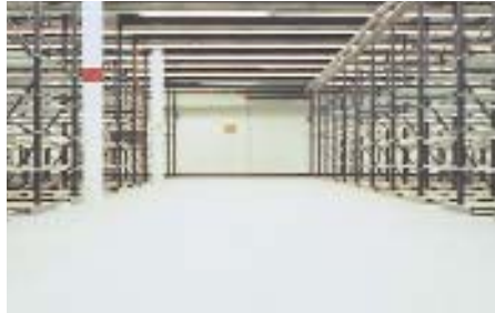
After ResinDek® replaces poly-deck the distribution center is a showplace!

"Employees were expressing concerns that areas of the poly-deck panels had started lifting up and were concerned about tripping. We struggled with these concerns and had been fighting with this problem for years. In the main aisles we had covered the poly-deck with steel plates to be able to move products and to prevent safety hazards. This patchwork increased as the poly-deck panels continued to cut and split in several of our heavy traffic areas. As the panel comes apart, it flexes up and down with traffic resulting in splits that look like a series of alligator skin cracks. The cracks were about 12" long and 1-2" apart."