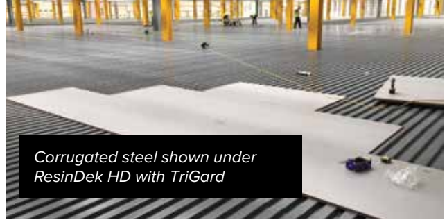
Corrugated steel shown under ResinDek HD with TriGard

"We are sold on the superiority of the ResinDek Flooring System compared to a traditional concrete floor!"