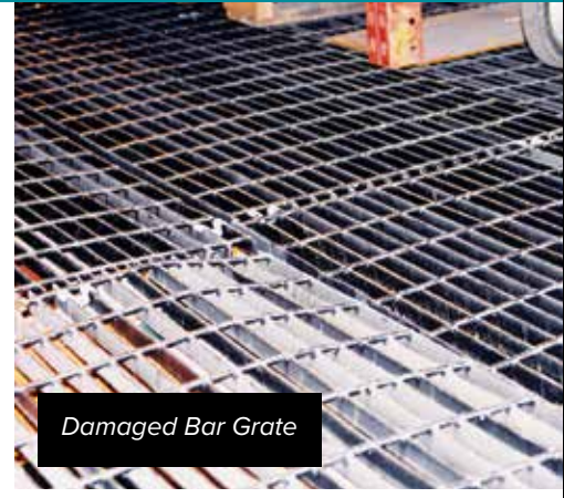
Damaged Bar Grate

“As an added benefit, Cornerstone offers us a ResinDek panel with an electrostatic dissipative surface. Before we started using ResinDek panels with ESD, we were experiencing some static shocks to our associates, and occasionally, the servo drive motors on our conveyors were shorting out. ResinDek panels with ESD has saved us countless hours in needless down time and expensive repairs.”