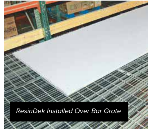
ResinDek Installed Over Bar Grate