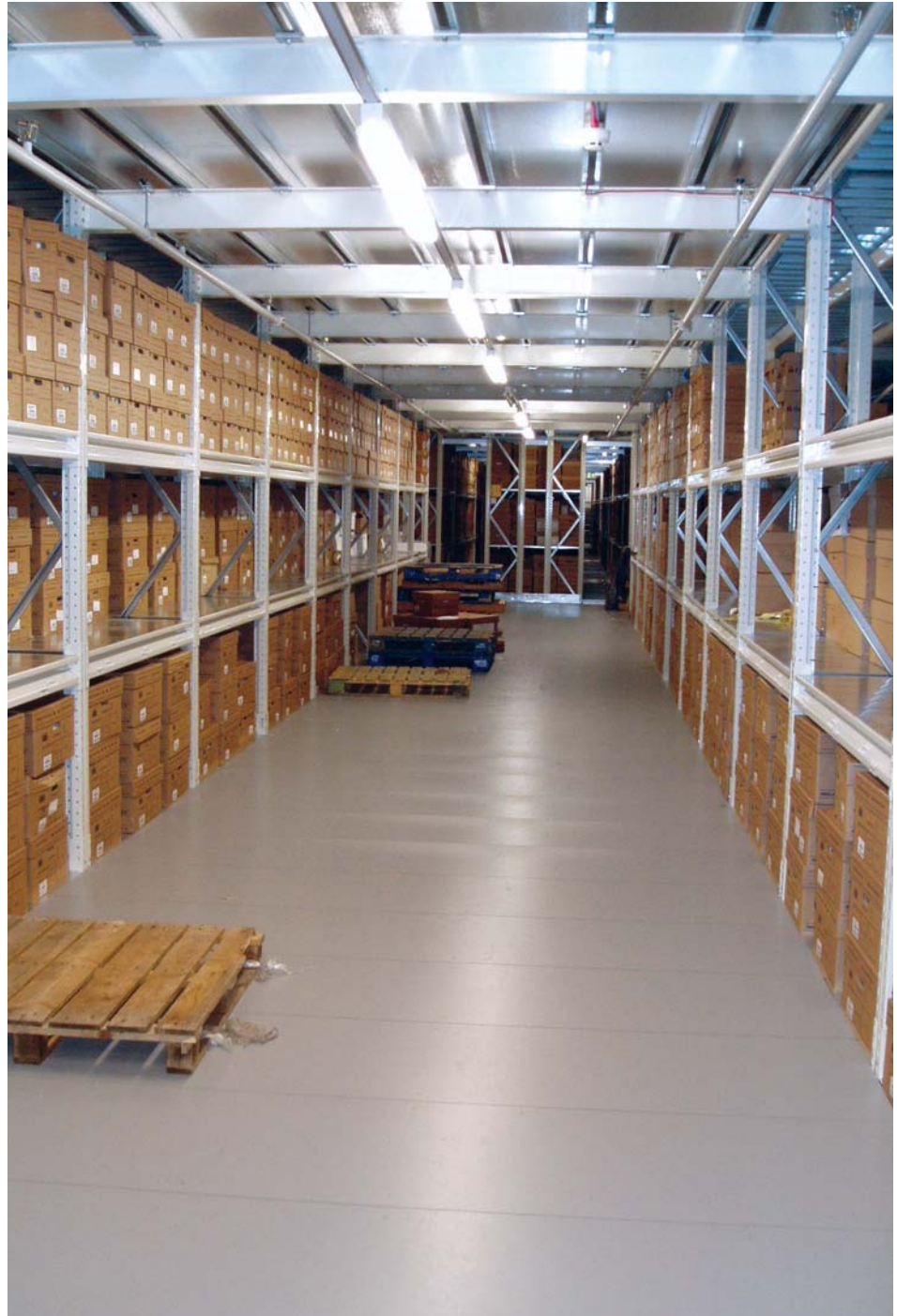
Iron Mountain ® in Belvedere, UK with ResinDek Xspan installed for rigorous loads of 1,000 kilograms 100 times a day