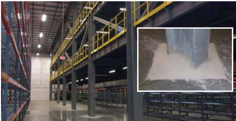
Concrete mezzanine floors require massive amounts of extra steel and footings driving up costs.