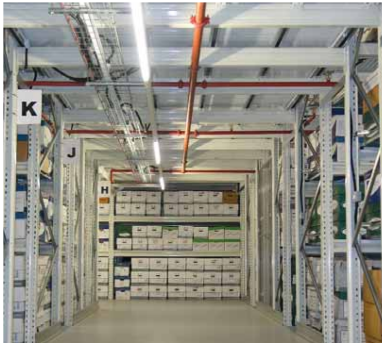
On larger orders, white underside is available. ResinDek® Xspan® FR meets UK Class "O", as well as European standards EN 13501-1 and is rated as C FL -s1. ResinDek® panels have been independently audited for certified factory process controls and ce marks are available upon request.