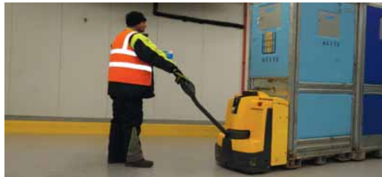
Elevated flooring system carries rolling loads of 3,000 kgs. Stronger than concrete at a fraction of the price!

Ace Hardware Aéropostale Amazon.com American Honda Motor Co Aveda Products Bayer Healthcare LLC Big Lots Bridgestone/Firestone Brookstone Cabela's Capitol Records Cardinal Health Carhartt, Inc. Carquest Caterpillar Champion Products Mervyn's Corporate Express CVS Pharmacy Do It Best Dollar General Family Dollar Finish Line Gap Inc. Godiva Chocolatier Gordon Food Service Graco Children's Products Harley Davidson of Annapolis Starbucks Coffee Hobby Lobby Hoover Co. Iron Mountain JCPenney Jo-Ann Johnson & Johnson Jordan's Furniture Kohl's Lidl Linens-N-Things Liz Claiborne L'Oreal Marriott Towne Place McMaster-Carr Converse Michaels Nautica Enterprises Neiman Marcus Nike Nissan Norm Thompson Outfitters Now Natural Foods Office Depot O'Reilly Auto Parts Orscheln Farm & Home Pep Boys Pfizer Inc. Polo Dist. Center Rite Aid Roadway Trucking Rockler Companies Rocky Boots & Shoes Scholastic Book Fairs Sears Seiko Sherwin-Williams Co. Sofa Express Sony Music Southern Wine & Spirits Staples Subaru Technicolor The Children's Place The Home Shopping Network The Sports Authority Tom Gill Chevrolet Tractor Supply Valvoline DC Victoria Secret Vans Tuesday Morning Walgreens Wal-Mart Williams-Sonoma Wincanton Zappos.com La-Z-Boy Kennametal Leather Gallery Great American Insurance Co. Fred Meyer Freightliner of Evansville GameStop Christian Book Distributors Chico's Fashion Child Craft Arbonne International