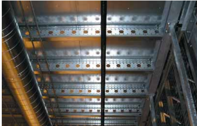
Customer chose a G60 galvanized underside finish for light reflectivity, added strength and fire protection.